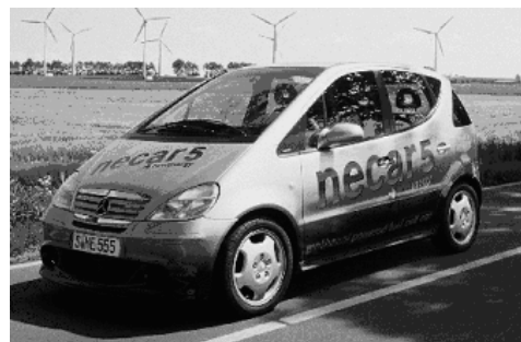
Figure 3: Fuel Cell Vehicle, Germany

It was agreed upon that fuel cells will contribute to the world's future cleaner energy supply by exploiting their high efficiency and low pollution levels. Thereby, the introduction of bio-ethanol based fuel cells will have to take advantage of the existing bio-ethanol infrastructure in Brazil providing a suitable fuel supply with a low level of contaminants. Nevertheless, extended research on the micro-contaminants in bio-ethanol has to be performed to ensure safe operation of the fuel cells. Furthermore, ethanol fuel cells, both direct conversion or via reforming, are currently still in the R&D stage. Especially the charge transfer in direct ethanol fuel cells still needs to be optimised and further research is required in order to find a suitable catalyst. Although commercialisation of ethanol based fuel cells is therefore not expected in the very near future, there is a great opportunity for cooperation between countries developing innovative fuel cell technologies and Brazil with its long term experience in the production and processing of bio-ethanol (Figure 3).