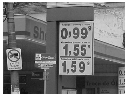
Figure 5: Bioethanol-gasoline blend sold at Brazilian gas station

The new law will allow private industry (national and international) to start production of bioethanol to be blended with gasoline (10% volume) in the year 2006, thereby saving 6 million tons of CO 2 per year. The LAMNET member CORPODIB (Corporation for the Industrial Development of Biotechnology and Clean Technology) has been actively working in this project during the last seven years. It has elaborated the feasibility study and the implementation plan, and will follow the project during its implementation stage [Echeverri (2002)].