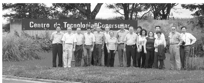
Figure 1: Visit at the Copersucar Technology Center

In 2003, the LAMNET network is continuing all activities in order to strengthen this trans-national forum for the promotion of biomass and bioenergy in Latin America, Europe, Africa and China. It will thereby contribute to the establishment of modern energy supply systems which are fully in line with today's crucial goals of poverty eradication and sustainable development.