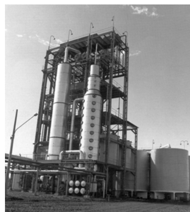
Figure 4: Distillation Column

The LAMNET co-ordination partner Prof. José Roberto Moreira from the Brazilian Biomass Reference Centre (CENBIO) was involved in the elaboration of the technical background document on biomass [Moreira (2002)]. These technical papers served to quantify the world capacity to obtain significant amounts of energy by the year 2010 from new and renewable energy sources. It is shown that through the use of 300 million hectare of land it is possible to fulfil the total global energy demand by using the most advanced agricultural and industrial technologies. The document concludes with a list of practical actions promoted by the Brazilian Energy Initiative that, if implemented, would allow most of the 102 sugarcane growing countries to rely on energy from sugarcane in the short-term and would initiate the creation of a large-scale global bio-ethanol market with significant impact on several OECD countries: