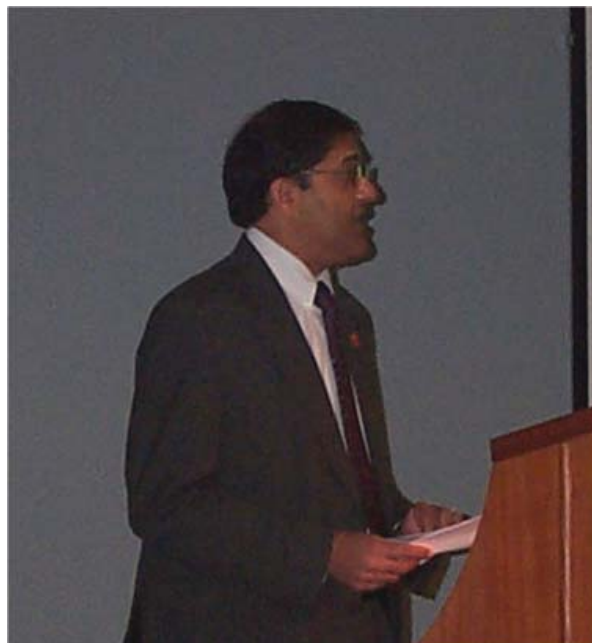
Inauguration address by Honourable Narend Singh, Minister for Agriculture and Environmental Affairs, Province of KwaZulu-Natal, South Africa.