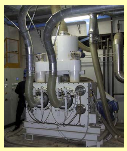
Pelletiser machine, KEMYX, Italy

These documents are currently under preparation. It is proposed that these techno/economic descriptions contribute to thematic leaflets produced in the framework of LAMNET activities.