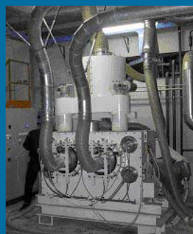
Pelletiser machine, KEMYX, Italy

FIRST LAMNET WORKSHOP, RAI Congress Centre, Amsterdam, The Netherlands, 19 June 2002