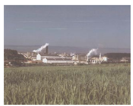
Figure 2. São Martinho sugar mill near the city of Pradópolis, State of São Paolo

from Brazil, Cuba, South Africa, Sweden, Italy and Germany that the network's activities regarding the promotion of bioenergy utilisation in emerging countries will mainly focus on the following topics: