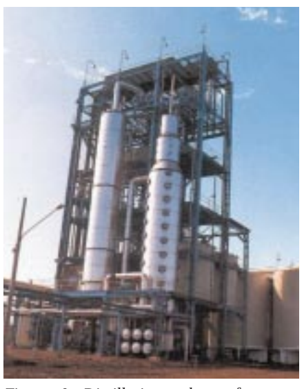
Figure 3. Distillation column from an ethanol production facility

Today, the largest producer of bioethanol is Brazil, where ethanol produced from sugar cane is continuously used as automobile fuel since 1975. Figure 2 shows the second largest sugar mill in Brazil with a capacity of more than 6 million tons of sugar cane per year and figure 3 shows a typical distillation column from an